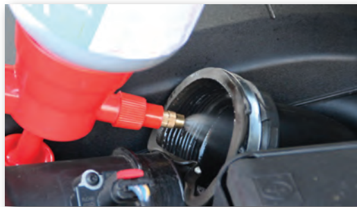
Removal of the fluid pick up pipe for inverted use.

On Variable Nozzle / Vane Turbos, using a Mitivac hand pump to actuate the turbo vanes to raise the turbo to full boost, and cycle the vanes, greatly increases the cleaning action.